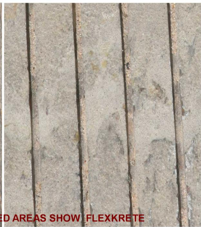
LIGHT COLORED AREAS SHOW FLEXKRETE