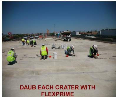
DAUB EACH CRATER WITH FLEXPRIME